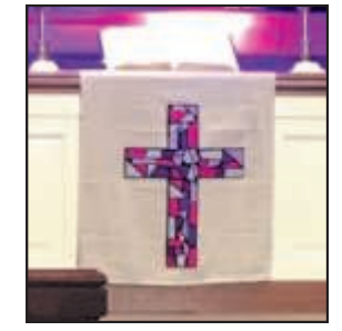
Stained glass cross formed from the broken pieces