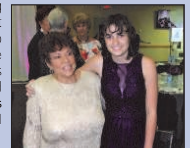
At HUG's Beyond Incredible event (see back page)