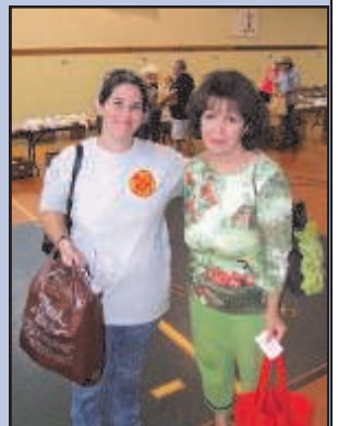
Thanksgiving FOR Pinellas