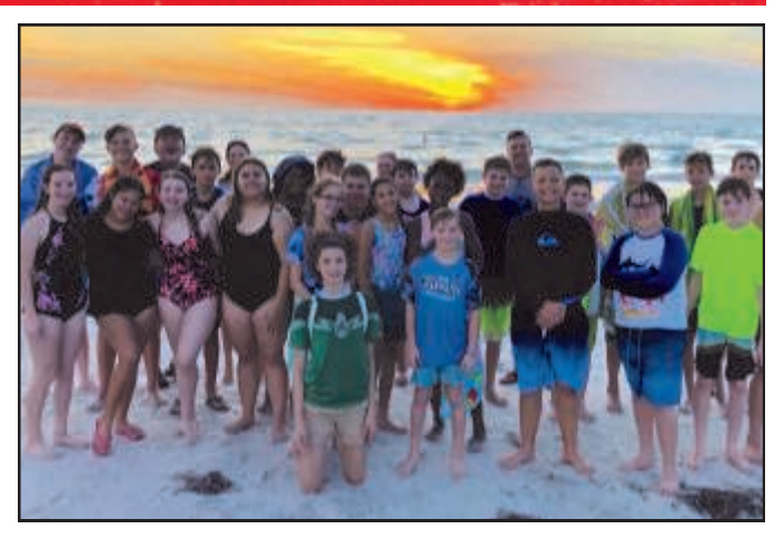
On Tribe Tuesday, our students went to the beach for their Independence Beach Bash! Enjoying God's creation together is life-giving!

Rachel-Lydia doesn't meet this month, but you can join them at their meeting on August 8 at 10:30 AM in room 106 (Carpenter's Room.)