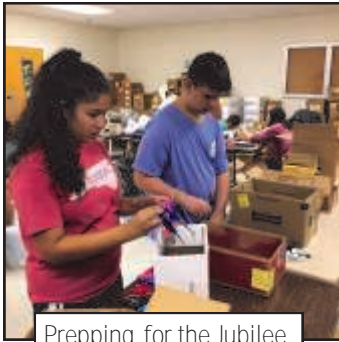
Prepping for the Jubilee

Our students have been serving on Wednesdays all summer long by helping to lead games for our Camp XP kids, helping to sort school supplies and do other prep work for the Back to School Jubilee, and writing meaningful cards to the campers for mail call. Thanks to everyone who served this summer!