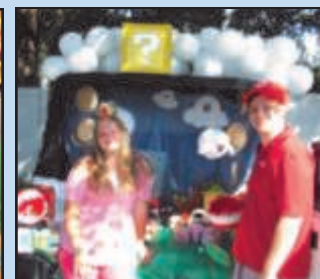
Patch Bash Trunk or Treat