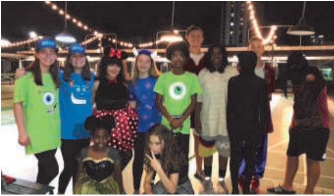
Costume Contest Finalists