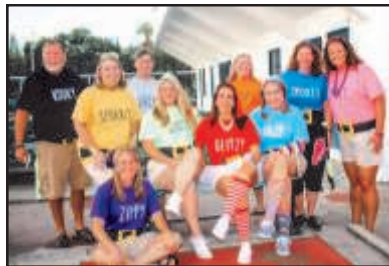
Student Ministry Team