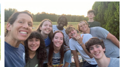
Students received cards from their Prayer Pals